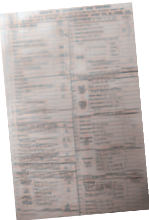
A returned form for the 'Second Domesday Book'