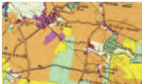
Eyke 1941 Land Survey Summary Map Extract

The agricultural census conducted in Eyke in June 1941 reports 18 farms or holdings over five acres. These are all consecutively numbered, except for number 11, which I have been unable to find. Whether the record ever existed, was misfiled or lost, I do not yet know. The other ten returns, taken together,